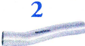
2 Piece for Easier Installation